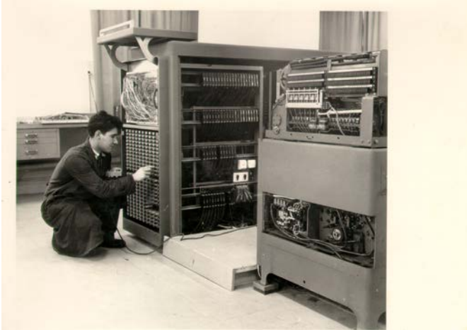
Fig. 1 Calculating punch M9 at Dietfurt with Max Forrer

we organized a video interview with three former customer engineers. It took place at the depository of the MfK in Schwarzenburg BE on 19 May 2011.