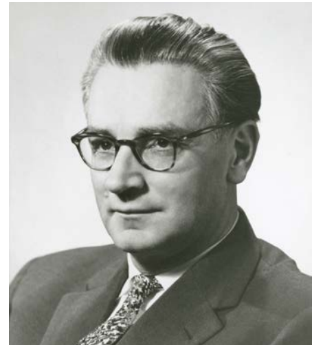
Konrad Zuse (1910–1995)